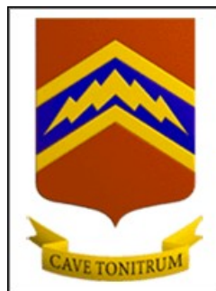
56 th Fighter Group