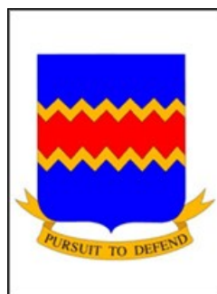
55 th Fighter Group

10-12: Veteran unit (Table M-4 DR +1, Initial). (4 th FG) D6: 1-4: Fair Cover. 5-6: Good Cover (and Poor Cover, Table M-4 +1, Initial and Successive, in one zone past the maximum Fighter Cover Range if Outbound.)