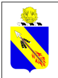
4 th Fighter Group

6: Veteran unit (Table M-4 DR +1, Initial). (4 th FG) D6: 1: Poor Cover. 2-4: Fair Cover. 5-6: Good Cover (and Poor Cover, Table M-4 +1, Initial and Successive, in Zone 5 if Outbound.)