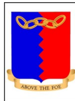
78 th Fighter Group